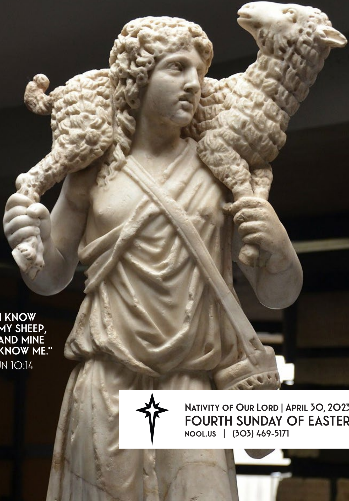
Good Shepherd, 300-350 AD, marble sculpture; Catacombs of Domitilla, Rome

"I KNOW MY SHEEP, AND MINE KNOW ME." JN 10:14